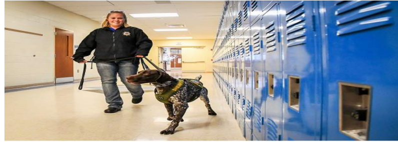
Passive Alert Search Canines