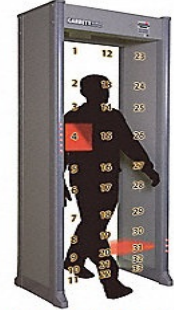
Garrett Walk-Through Metal Detectors at all Middle and High Schools