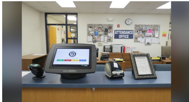
District-wide Comprehensive Digital Visitor and Emergency Management Platform