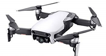
1 DJI Phantom IV Pro. Drone 8 DJI Mavic Air UAS Drone