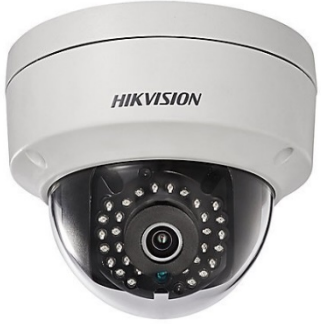
~3500 Surveillance and Classroom Cameras