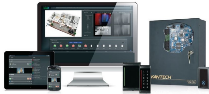
Kantech Entrapass Digital Access Control System on all exterior doors with on-site and remote monitoring