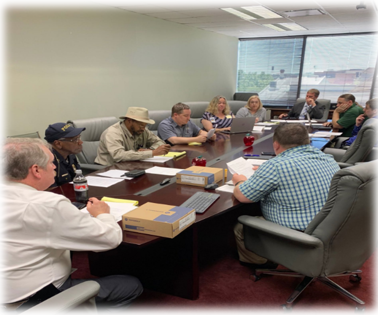
Monthly Multi-Disciplinary Safety and Security Committee Meeting